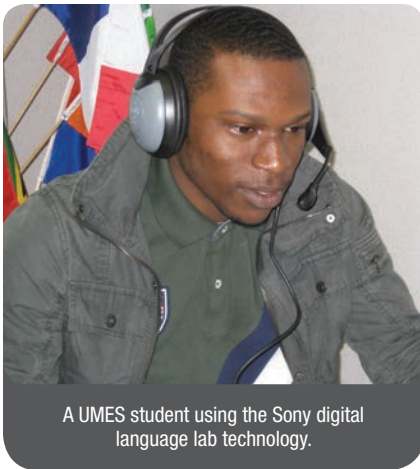
A UMES student using the Sony digital language lab technology.

How a university is using federal funding to give voice to languages less spoken.